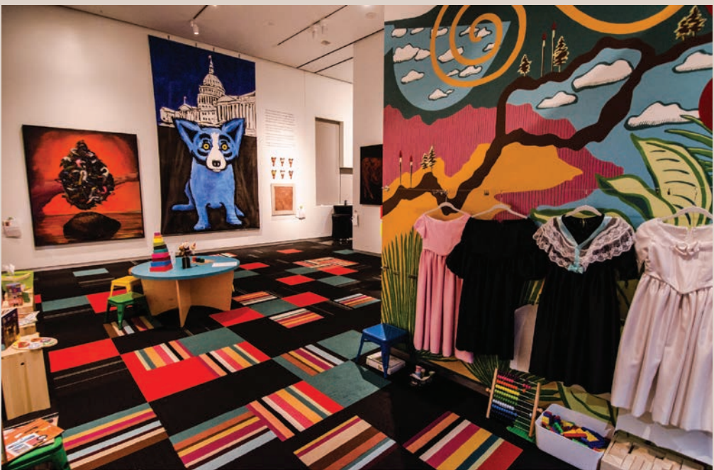
NEW PENNINGTON FAMILY FOUNDATION EDUCATION GALLERY

Discovery, Learning, Diversity, and Engagement: four tenets the LSU Museum of Art lives and breathes in our work. Help us continue to make a difference in our community by supporting these programs. It’s a great way you can make a direct impact and support LSU’s goals.